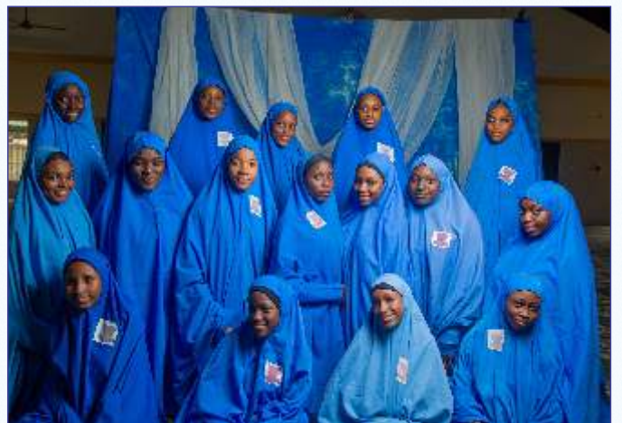
Basic 6 Girls Group Picture