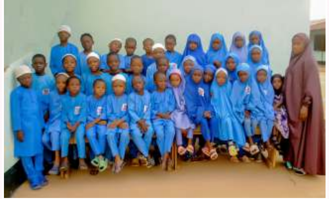
Pre-Basic Three (B) and their Teacher