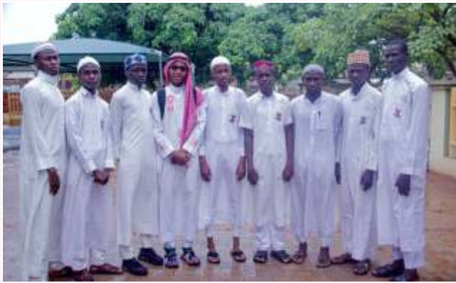
Post Basic 3 Boys Group picture