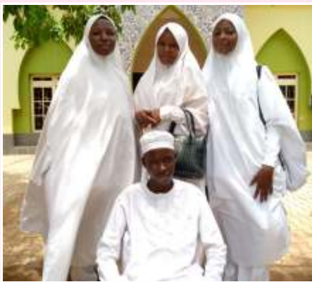
Post Basic 3 External Students From Babban- Saura