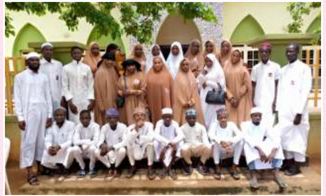
Post Basic 3 Class of Group picture