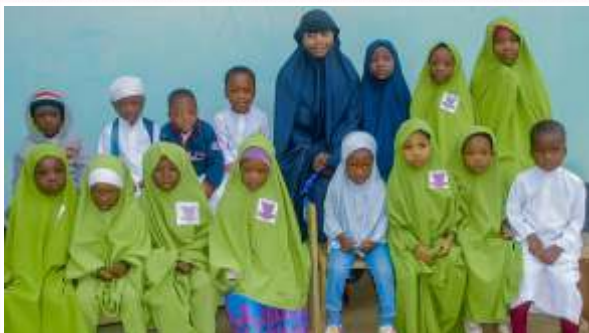
Pre- Basic Tahfeez and their Teacher