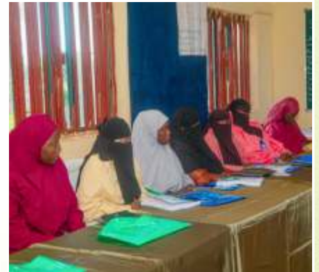
Our mothers at the seminar 2021.