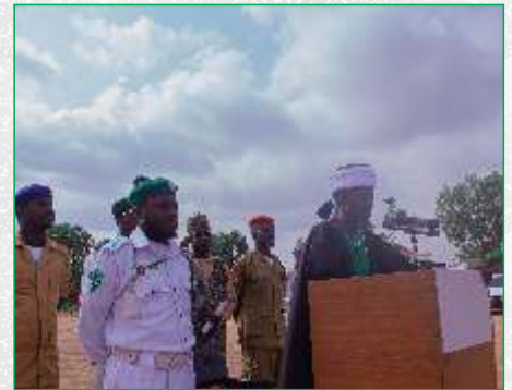
Addressing Khutubah by the Chief Imam at Eid prayer ground.