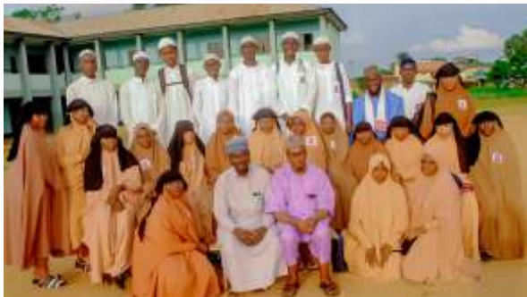
Post Basic One and their Teachers