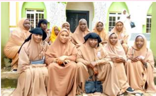
SIS 3 Girls Group Picture