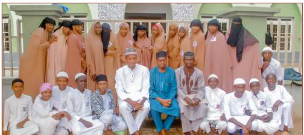
Basic Nine Class Group Picture