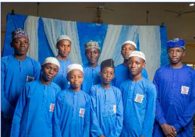
Basic 6 Boys Group Picture