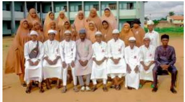
Post Basic Two and their Teachers