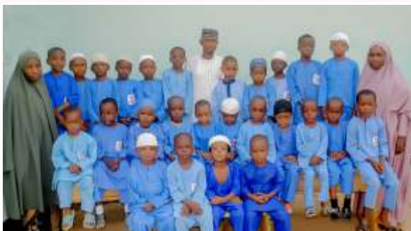
Pre- Basic Two Boys and their Teachers