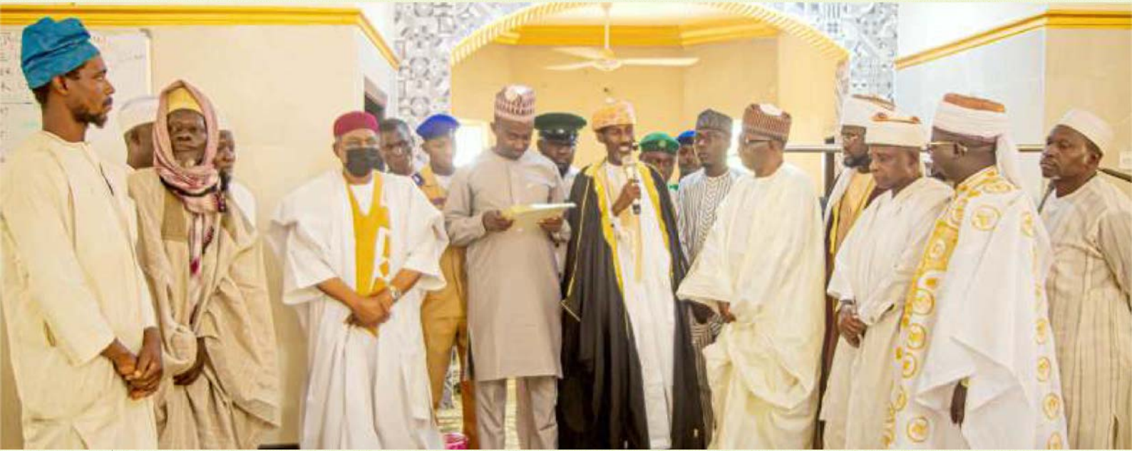
Chief Imam addressing speech upon his inauguration.