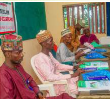
Participants and their lecturers in seminar 2021