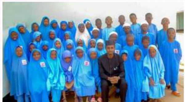
Pre- Basic Three (A) and their Teacher