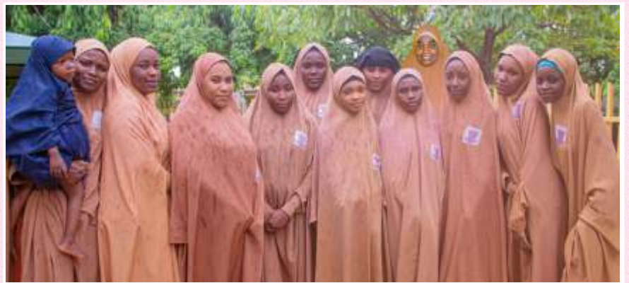
Post Basic 3 Girls Group picture