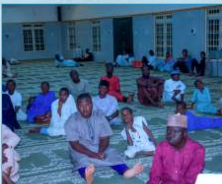
2022 Muhadara between Magrib and Isha'i @ HFI Mosque.