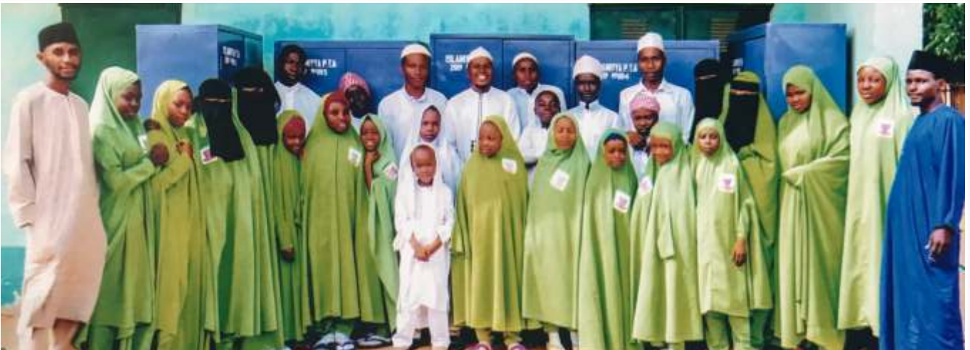
Students and Some Teachers during the luncheon