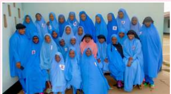
Basic Three Girls and their Teacher