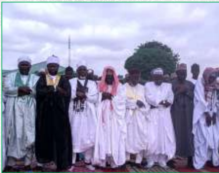
During Eidul-Kabir prayer 2022.