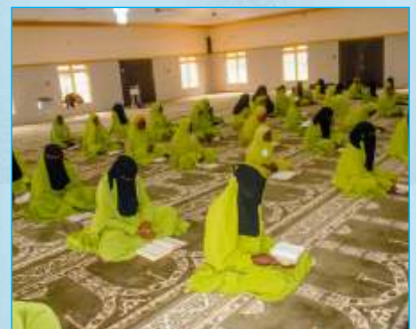
Girls Pupils memorising Qur'an from Tahfeez Section.