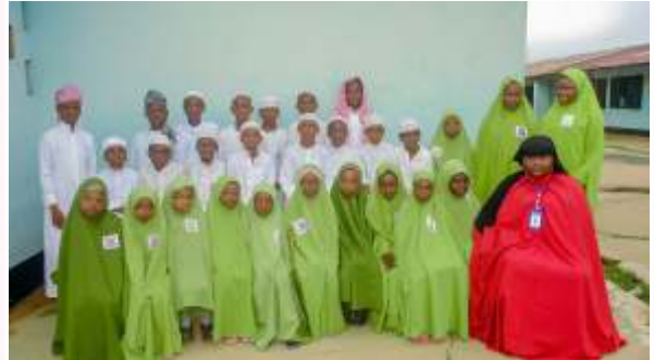
Nursery Three(A) and their Teacher