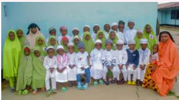
Basic One Tahfeez and their Teachers