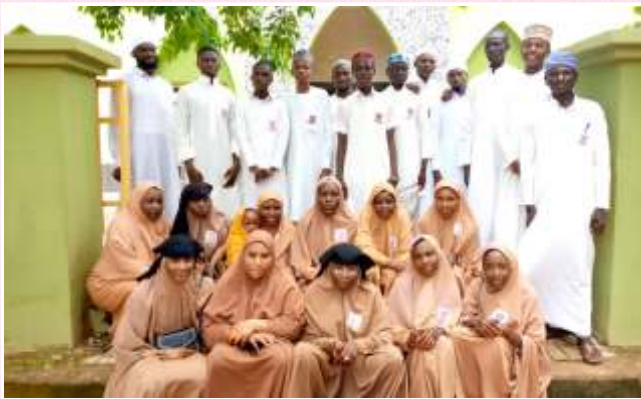
Post Basic 3 Group picture