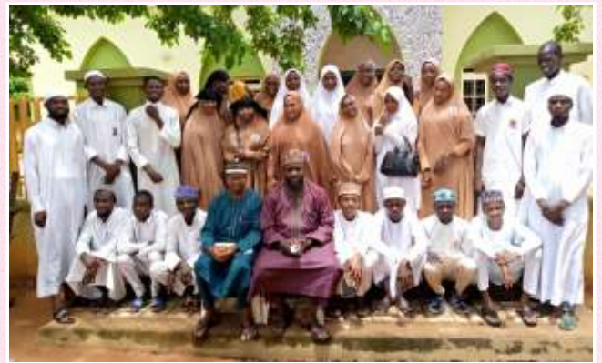
Post Basic 3, Exam officer and principal