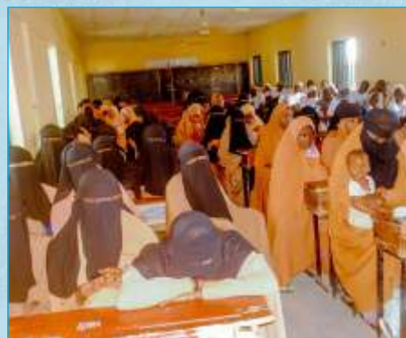
Arabic Students at the School hall.