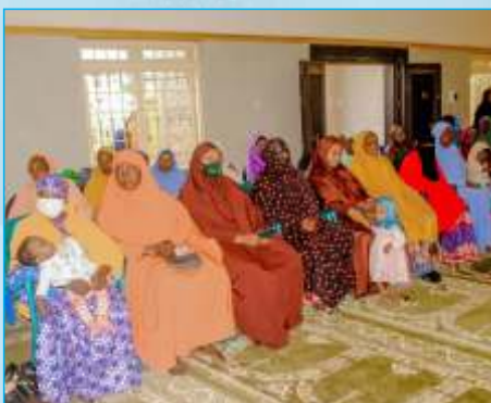
Female parents during programe.