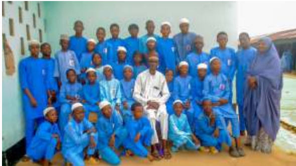
Basic Four Boys and their Teachers