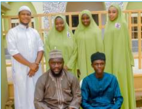
Memorizers and their Teachers