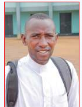
Ibrahim Jamaica Asst. Photographer