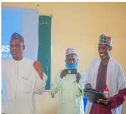
From Right HFI Director during the seminar 2021.