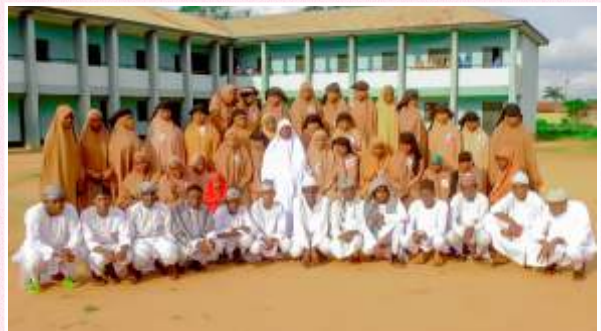
Basic Seven and their Teacher