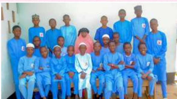
Basic Three Boys and their Teacher