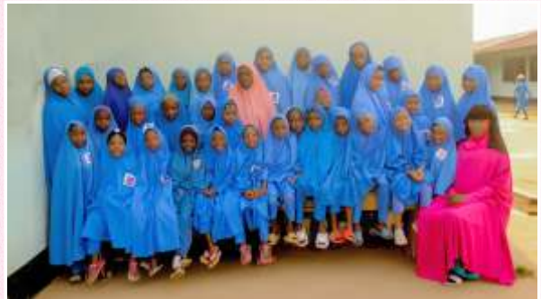
Basic One Girls and their Teachers