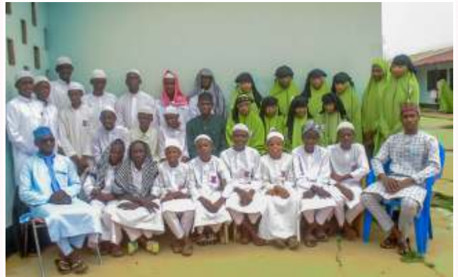
Primary Two Tahfeez and their Teachers