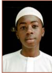
Muhammad A. 'Yar Adua