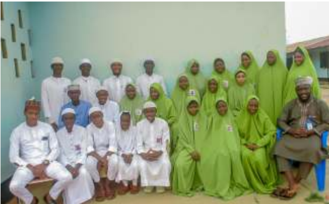
Primary Three - Six Tahfeez their Teachers