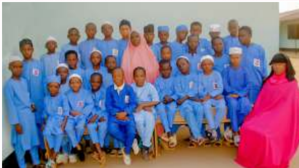
Basic One Boys and their Teachers