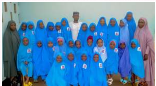
Pre- Basic Two Girls and their Teachers