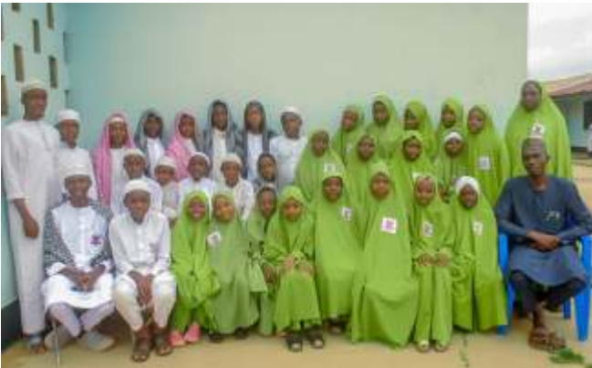
Primary One (A) Tahfeez and their Teacher