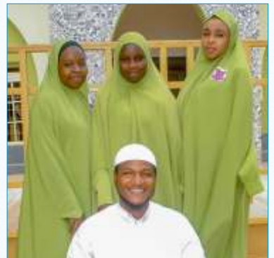
Memorizers Group Picture