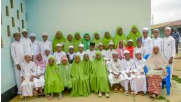
Nursery Three (B) Tahfeez and their Teacher