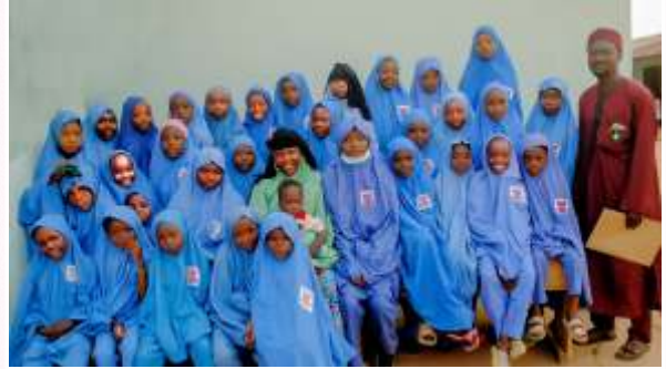
Basic Two Girls and their Teachers