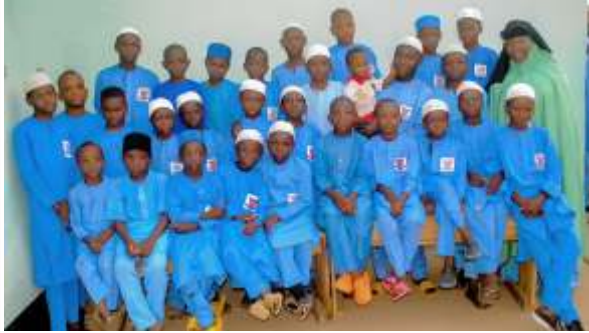
Basic Two Boys and their Teacher