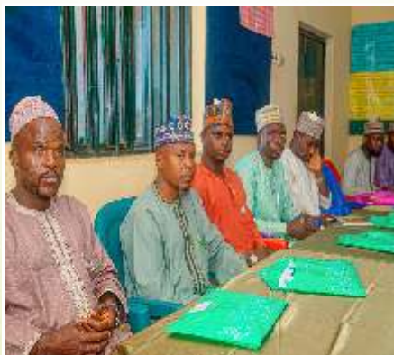
Participants during the 2021 seminar