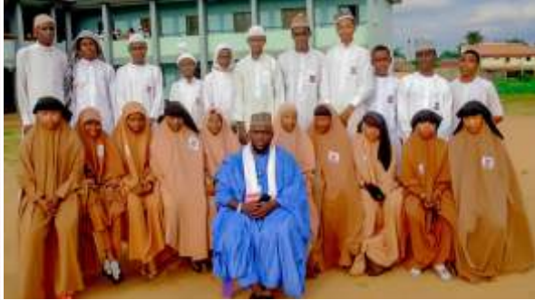
Basic Eight (8) and their Teacher