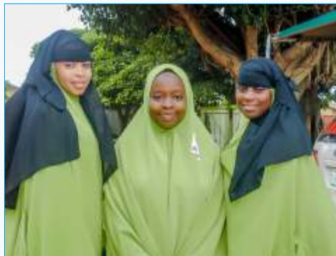
Memorizers G. Picture