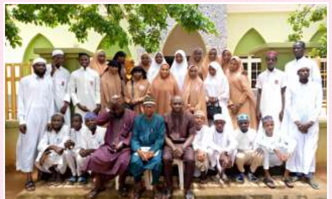
Post Basic 3, Exam officer, Principal and External Supervisor(NBAIS)