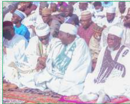
2022 Eidul-Fitri prayer