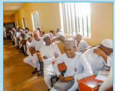
Arabic Students waiting for the next lectures.