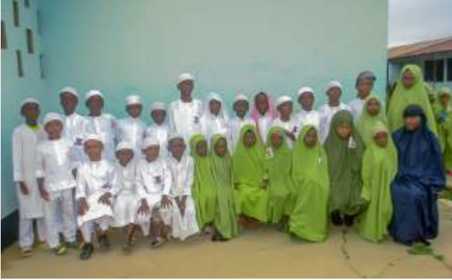
Pre- Nursery Tahfeez and their Teacher