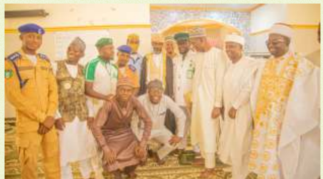
May Allah help and protect our Chief Imam.