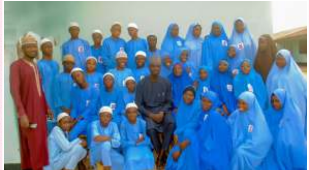
Basic Five (B) Cross Section and their Teachers