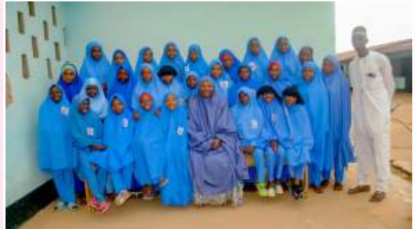
Basic Four Girls and their Teachers