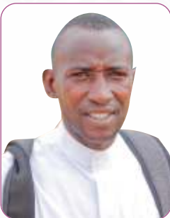
Ibrahim Lawal Photographer