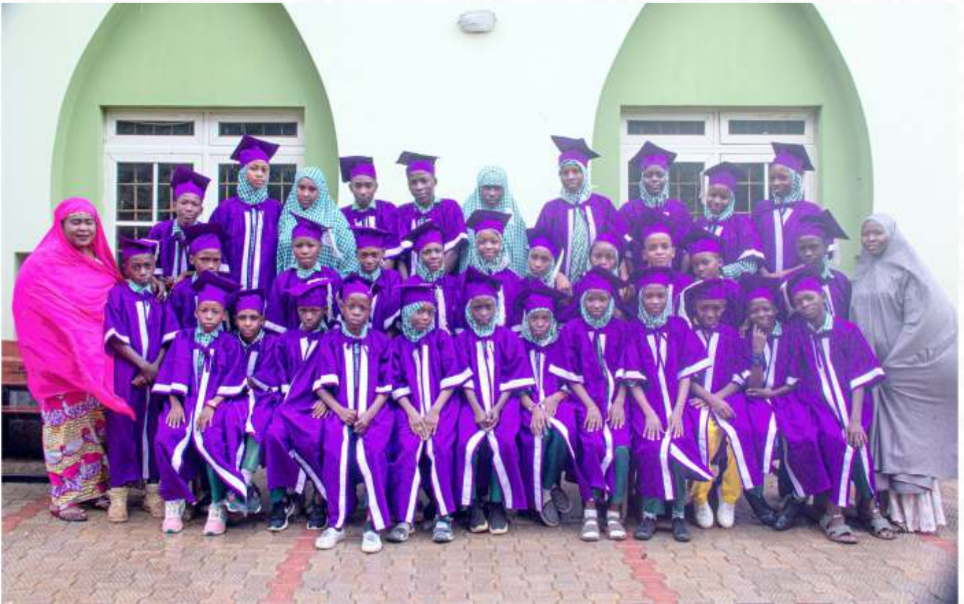
BASIC 6 CLASS PHOTOGRAPH WITH THEIR TEACHERS