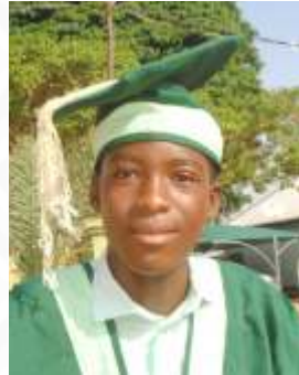
Abubakar Sadiq Sanusi