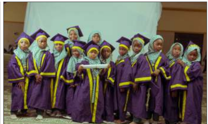
2022 - 2023 PRE-BASIC 3 GIRLS GRADUANDS