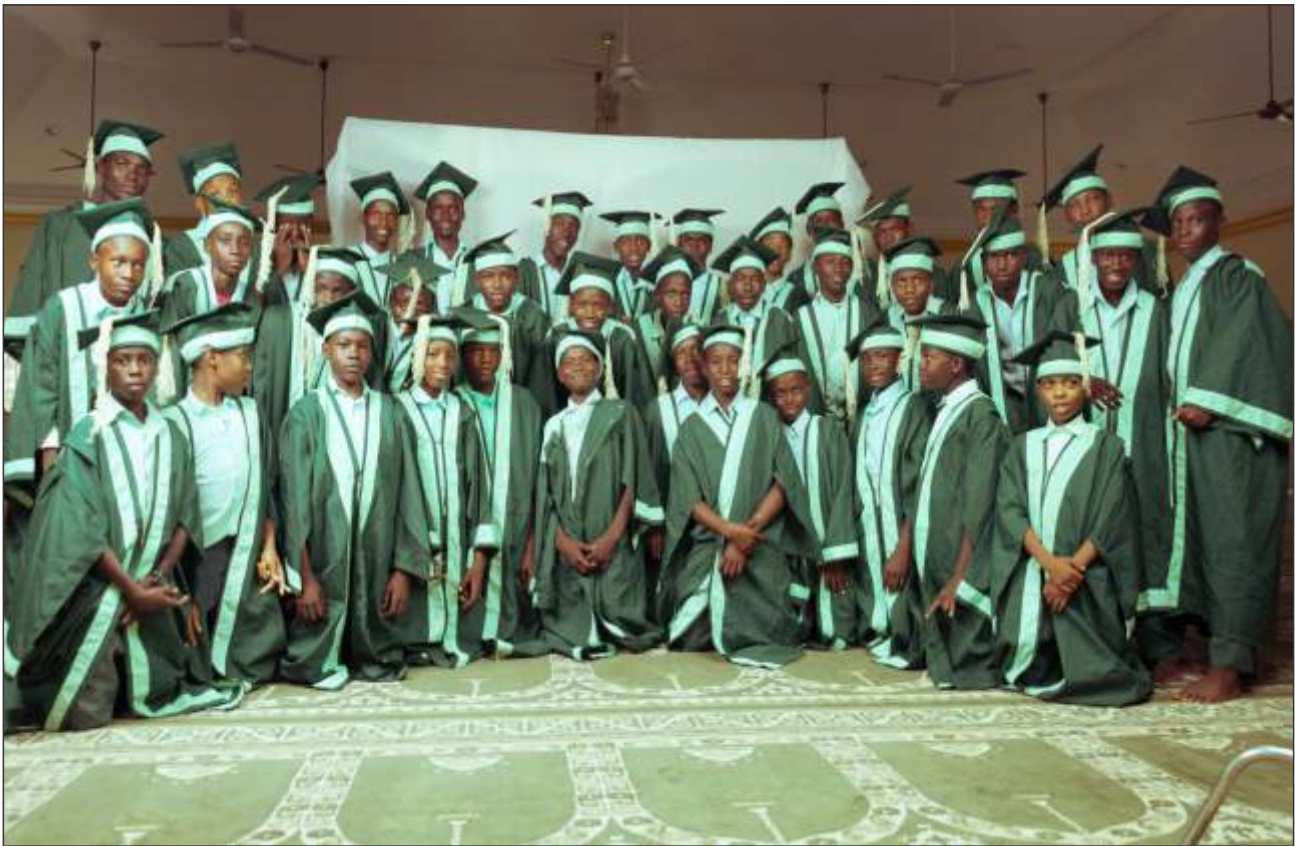
2022-2023 BASIC 9 GRADUANDS (BOYS)