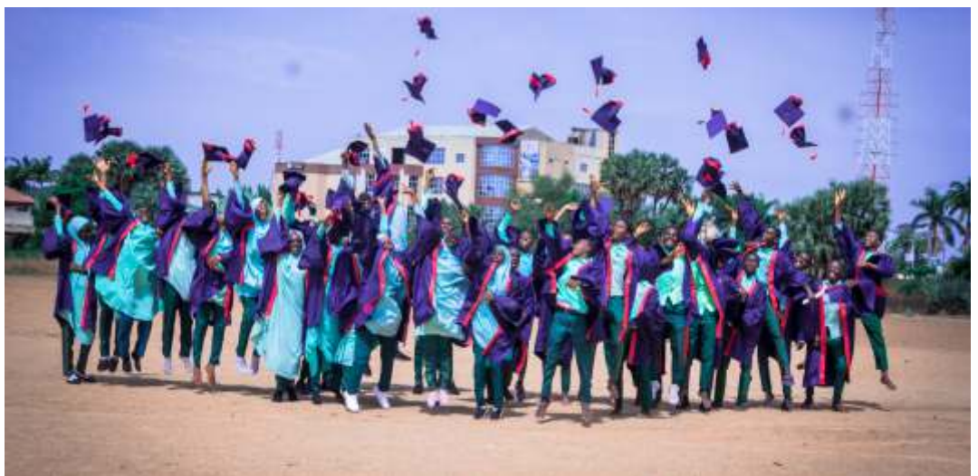
CLASS OF 2023. POST-BASIC III