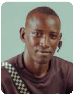
Ibrahim Lawal Photographer