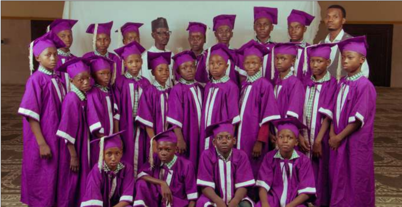
2022-2023 BASIC 6 GIRLS GRADUANDS