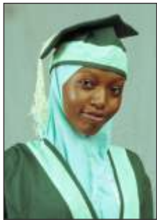
ASTHMA' U MUSA