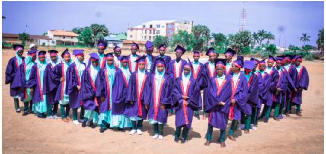
CLASS OF 2023. POST BASIC 3 GRADUANDS