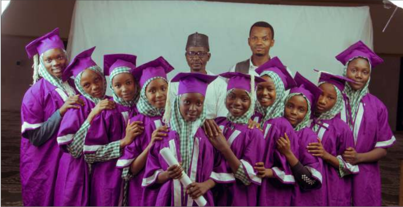
2022-2023 BASIC 6 GRADUAND GIRLS